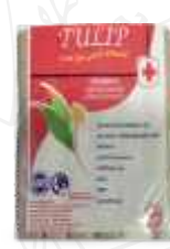
PRINTED POLYTHENE BAGS FOR VARIOUS USAGES