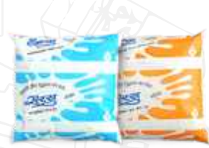
MILK, CHHACH AND LASSI PACKING FILMS