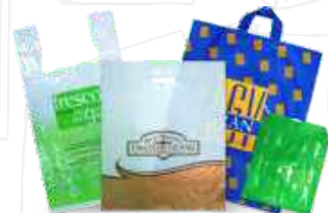
PLASTIC CARRY BAGS