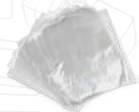
POLYTHENE INDUSTRIAL LINERS