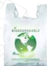
100%BIO DEGRADABLE BAGS / ECO FRIENDLY D2W BAGS