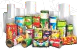
LDPE LAMINATION FILMS FOR PET, BOPP AND CPP LAMINATION