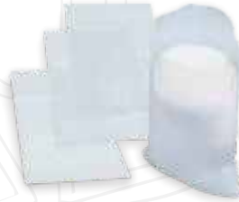
FOOD GRADE LDPE LINERS FOR MILK POWDER AND OTHER FOOD ITEM PACKING