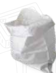
HDPE LINERS FOR WOVEN SACKS AND JUTE BAGS