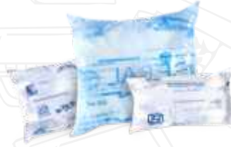
WATER PACKING FILMS