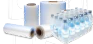
LDPE SHRINK FILMS FOR ALL KINDS OF SHRINK WRAPS